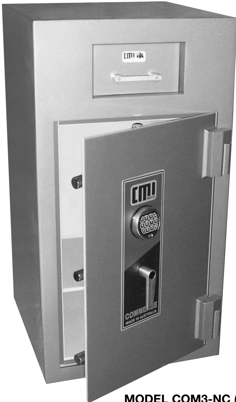
MODEL COM3-NC (FRONT ACCESS)

Available in front, rear, side or through wall access