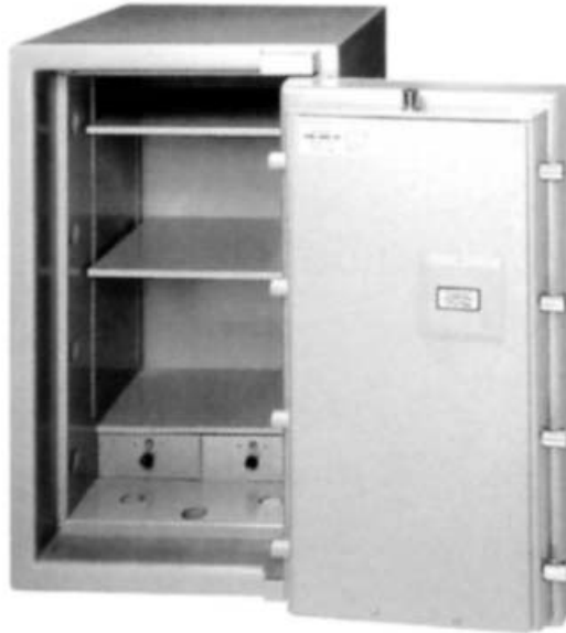
THE COMMANDER MODEL CR4 IS SHOWN ON THIS PRINTED MATERIAL.

INSURANCE COVER: Insurance surveyors have suggested $80,000.00 as a realistic rating for overnight holding of valuables by the Commander Safe in an unsupported situation.